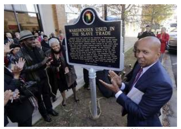
BHC Marker (Large 30"h x 42"w)