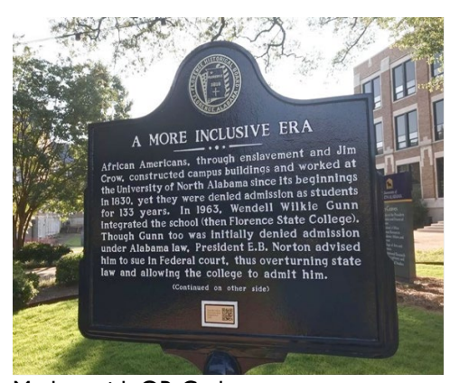
Marker with QR Code