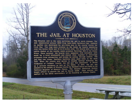
AHC Historical Marker (Large 30"h x 42"w)