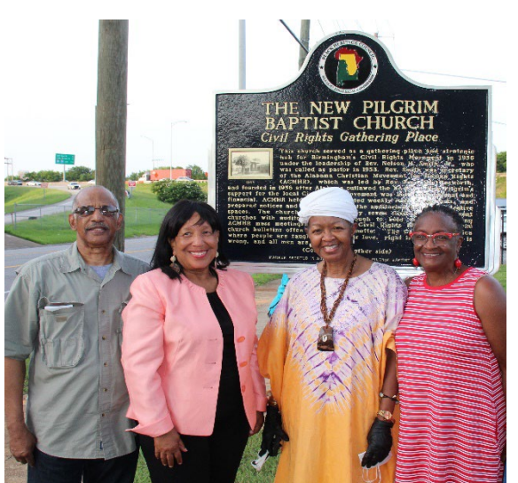
Marker with Photograph (Large 30"h x 42"w)